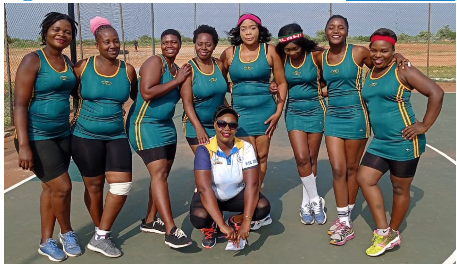
The PUSSAM netball team won a bronze medal at the 2022 SAUSSA games