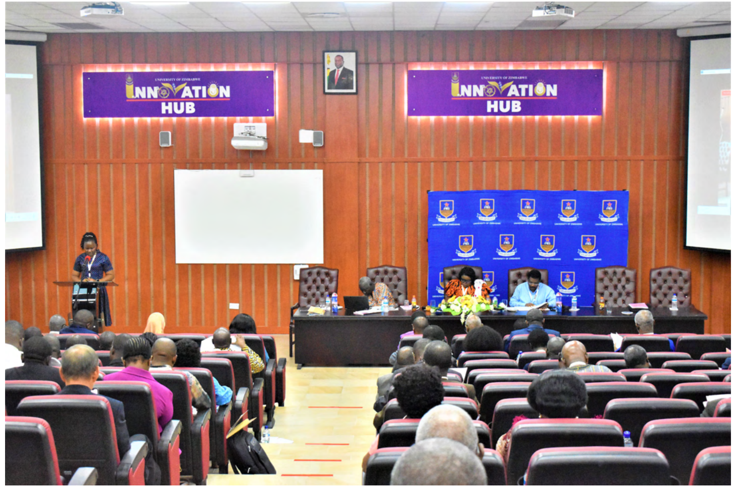
RUFORUM Vice Chancellors meeting at University of Zimbabwe Innovation Hub Auditorium

expertise, innovations and achievements that will shape the future of African universities and make them more relevant in solving problems being faced by African nations.