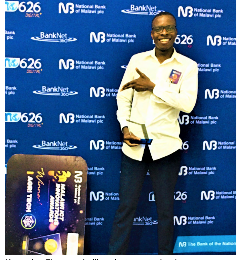
Nangwiya: The award will motivate me to develop more applications

Unfortunately, some notorious vendors collect certified suppliers' used packs and re-package seeds that have not been treated and sell them to farmers.